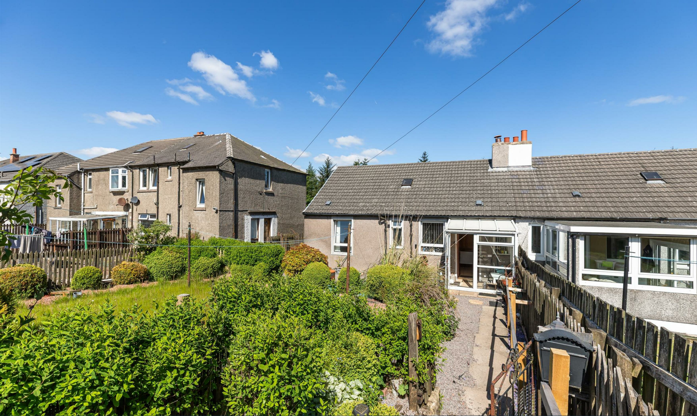
6 Dewshill Cottages, Shotts, ML7 4NX